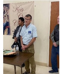
KCs served the PREP students dinner and hosted the art activity-Keep Christ in Christmas.