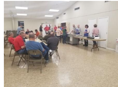
Dinner appreciation for First Responders.