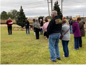
Veteran's Day Ceremony in the Cemetery at St. Joseph Catholic Church in Gluckstadt.

Followed by a reception in the Parish Hall sponsored by Council 11934.