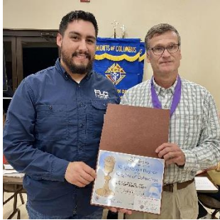
Newest members presented their 3 rd Degree Certificates.