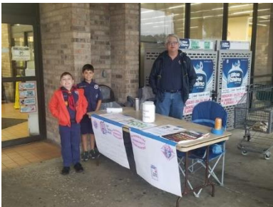
Food drive for the Storehouse Community Food Pantry of Vicksburg, MS at Corner Market. 1640 lbs of food and a little over $1300 in cash!