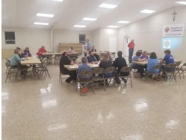
Trivia Night with the Knights.