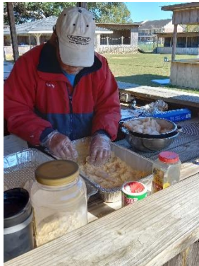
Fish, Beer, and good people successful and decent turn out.