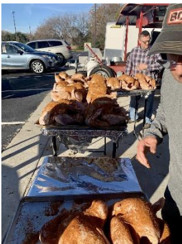
Smoked Turkey fundraiser for Thanksgiving.