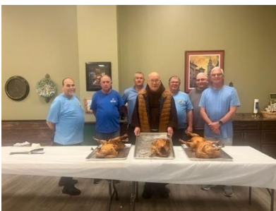
St Clare Knights of Columbus Council 16433 and Assembly 3837 had their annual "Fried Turkey Fundraiser."

The knights prepared 84 turkeys. In conjunction with St. Vincent de Paul, St Clare Conference the turkeys and other food was donated to 17 families.