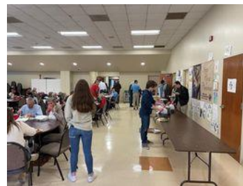
Spaghetti luncheon put on by Knights at Queen of Peace Catholic Church.