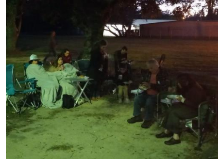
Council 9094 Parishioner Appreciation Barbeque a bit cold good turn out. It was a lot of fun. Good bonding time for MROD (Men Road to Discipleship) lightning fires, pulling pork, and watching football. a fish fry.