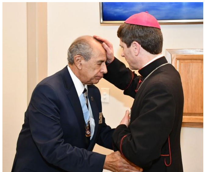
State Deputy Gets Blessing