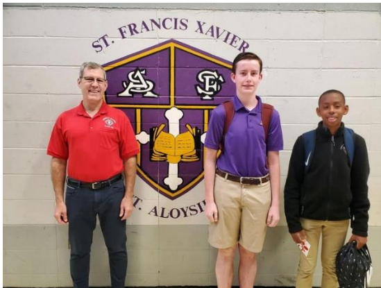
The winners of this year's freethrow contest