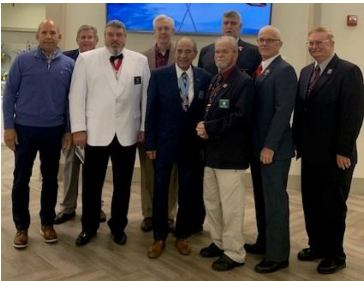
State Officers in attendance