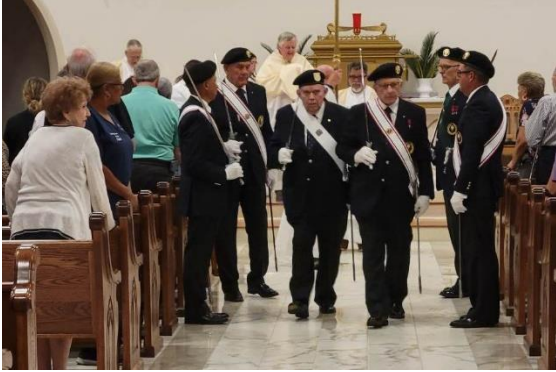
Holy Thursday Mass and Eucharistic Adoration from Most Holy Trinity Parish. Honor Guard from Assembly 3625.