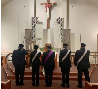
Sir Knights serving Honor Guard during Eucharistic adoration after Holy Thursday's Mass!