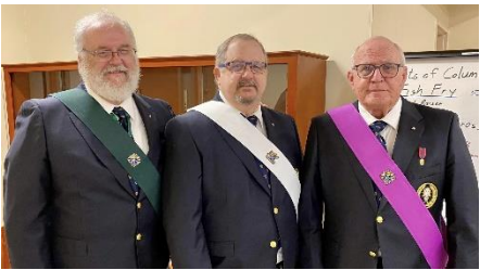
Assembly 3081 lead the congregation in the Stations of the Cross.