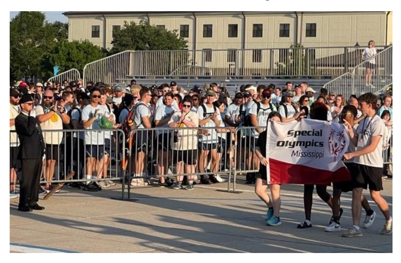
Fourth Degree Honors were provided for the opening events for the Special Olympics Games held at Keesler Air Force Base