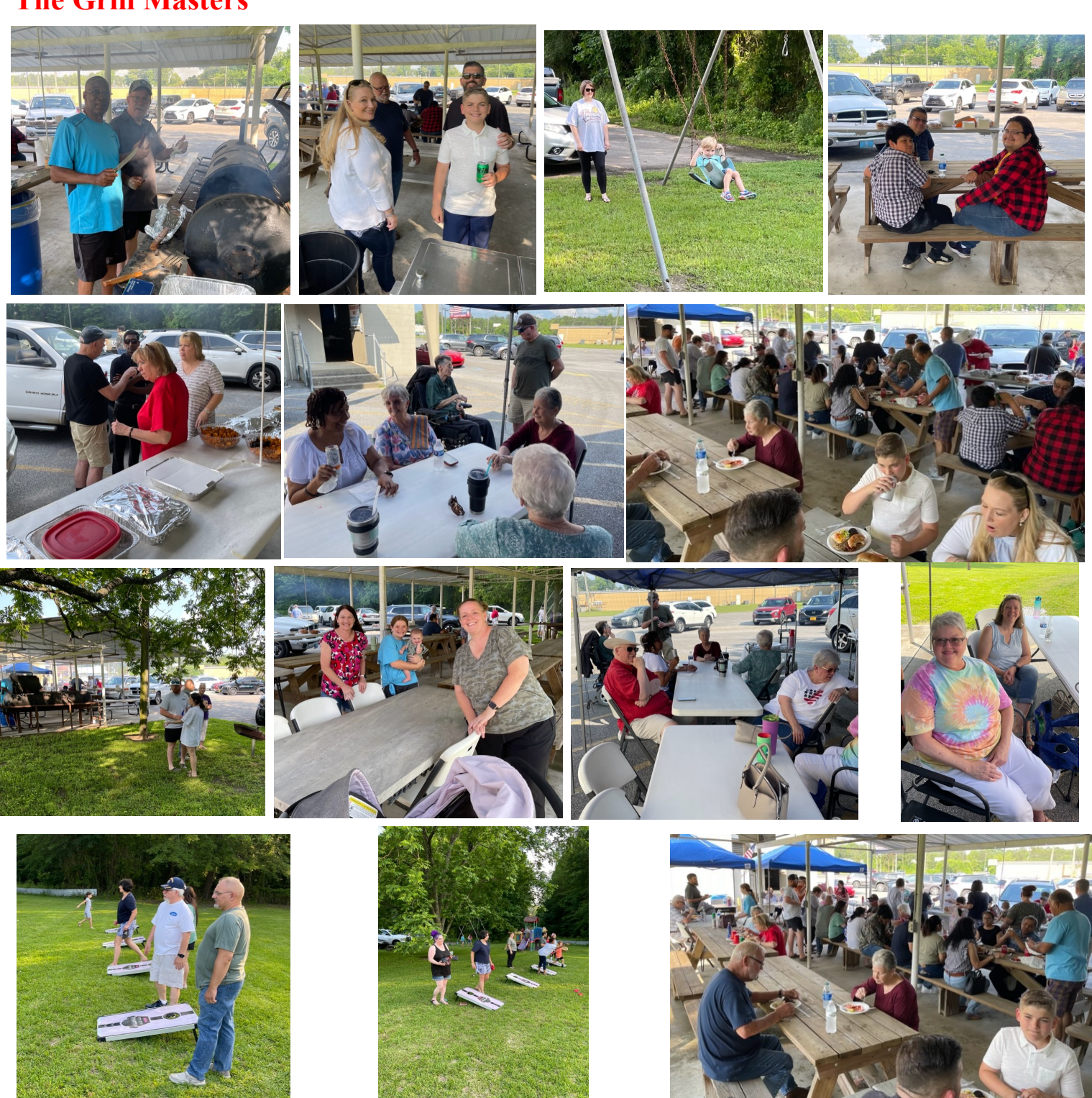
Fun, Games, and a Smorgasbord on Memorial Day 2023 At Council 802