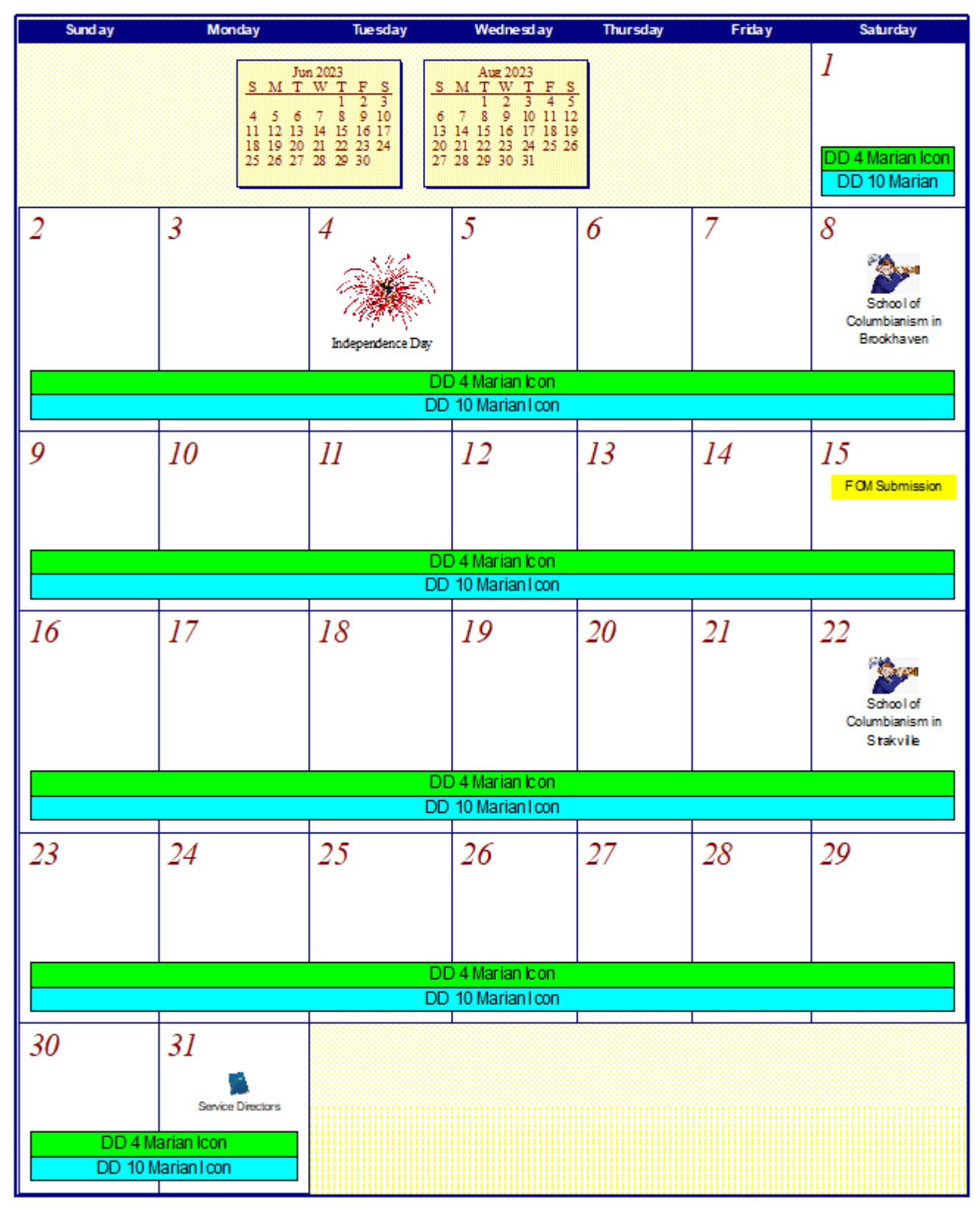
Page 4 of 12