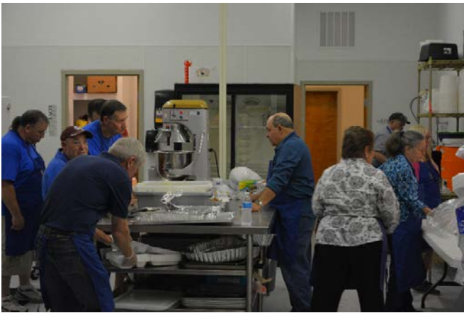
Plate preparations by our dedicated team of Brothers with the assistance of our Ladies Auxiliary