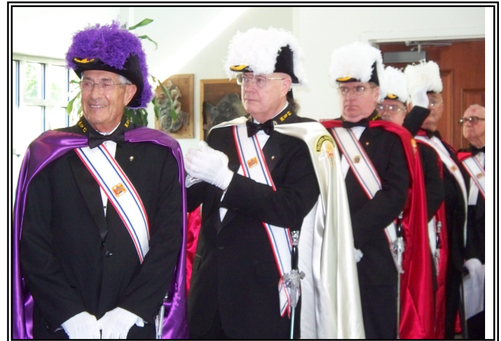
The Honor Guard for the Mass was comprised of 20 Sir Knights from around the Mississippi Jurisdiction.