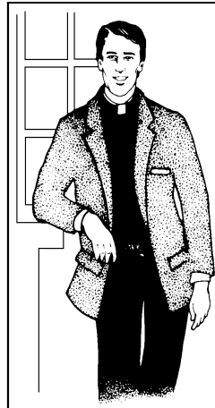
Another in a series of articles about men who have made the decision for the priesthood