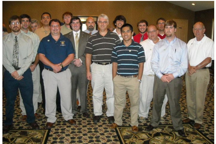
Grenada Council 10443 hosted a major exemplification earlier this month that produced 18 new 3rd Degree Knights, including five new members. Grenada had 7 degree recipients; Cleveland 5556 3; Oxford 1090, Philadelphia 13471 and Southaven 7120 2 each; and Greenville 2134 and Olive Branch 14051 1 each.