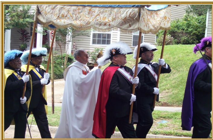
Members of August J. Stone Assembly 559 and the Knights of Peter Claver from Natchez carry the canopy in the Procession for the Feast of Corpus Christi from St. Mary Basilica to Holy Family Church. This was the first such procession in Natchez since the late 1960s.