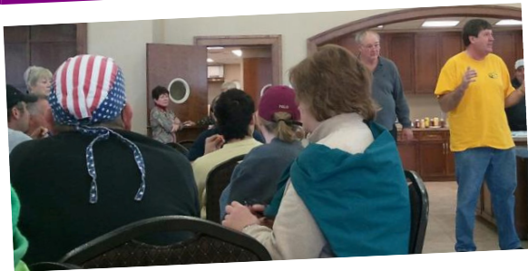
Briefing for Hattiesburg Volunteers