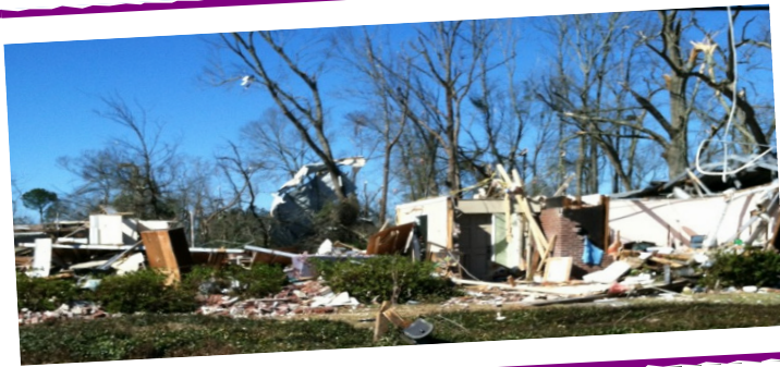
Damage was Severe Over a Wide Swath