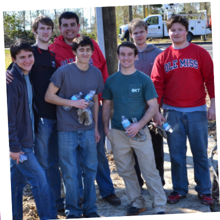
Ole Miss Students Responded