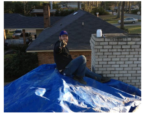
Up on the Roof