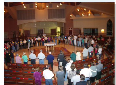
Council 5943 in Madison holds its annual Living Rosary on the third Wednesday in October as a Respect Life Month activity.