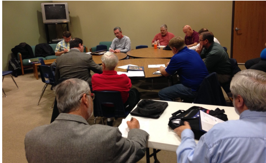
Grand Knights and Financial Secretaries of councils in Districts 5 and 6 meet with their District Deputies as well as state officers to discuss topics such as projects, membership recruitment and retention, and the state convention on Thursday, January 9 th at St. Richard Catholic Church in Jackson.