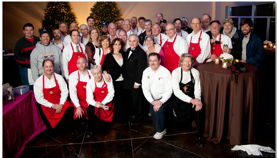
Pictured are some of the 59 Knights of Council 9543 of St. Francis of Assisi Catholic Church in Madison, who tuned out in force prepare and serve the delectable dishes at the annual Starry Night Gala to raise over $80,000 for St. Anthony Catholic School.