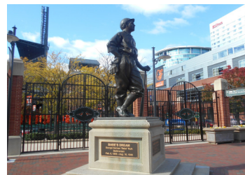
Babe Ruth statue outside Camden Park, Home of the Orioles. Ruth was also a 4 th degree Knight of Columbus