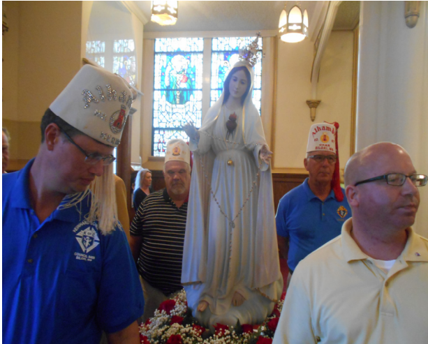
Above: Members of Alhambra carry statue of our Lady of Fatima. Men are also members of councils along the coast.