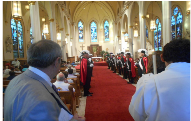
Right: Honor guard readies for entrance procession at Annual Rosary Rally, Blessed Virgin Mary Cathedral, Biloxi.