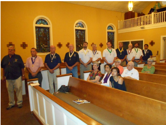
2014-2015 Council 10443 Officers after an installation mass in St. Peter, Grenada.