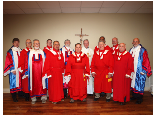
DDs, PSDs, State Deputy & State Chaplain in his Knights of Columbus chasuble presented at the meeting.