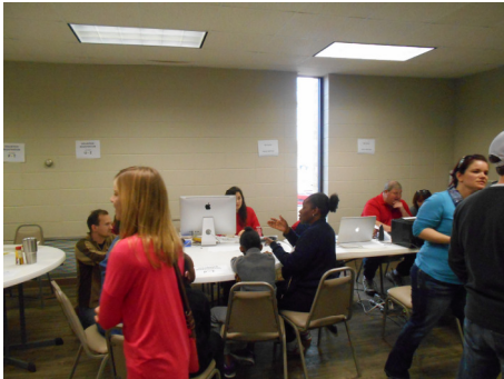
Volunteer Response Center Woodlawn Pentecostal Church Columbia MS