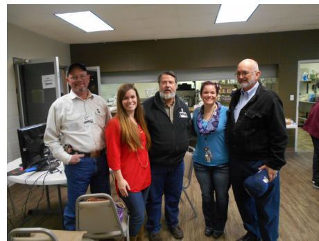
Louisville Tornado Relief Staff with Columbia Tornado Relief Advisors