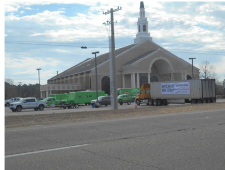
Disaster Response Center Woodlawn Pentecostal Church Columbia MS

On Wednesday, 23 December, 2014, Mississippi was once again devastated by destructive tornados. It was reported that up to 11 tornados touched down in our state with two cities (Laurel and Columbia) receiving damage. In the aftermath, while first responders were doing their jobs, Volunteer Mississippi, a state organization responsible for disaster response operations, called the MS Knights with a request: "Can you help?" Our MS KofC Disaster Response team responded; "yes we can" and immediately went into action.