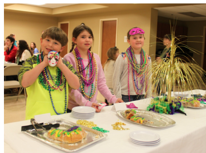
An informal Krewe formed during the Fat Tuesday dinner held at St. John the Evangelist Church and gave the pre-Lenten celebration a party-like, Mardi Gras atmosphere. The King Cake table with the multiple varieties of King Cakes was one of the most popular stops of the night.