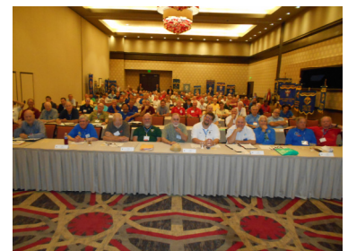
Delegates seated at Business meeting.