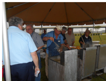
Legendary Fry Team preparing meals for