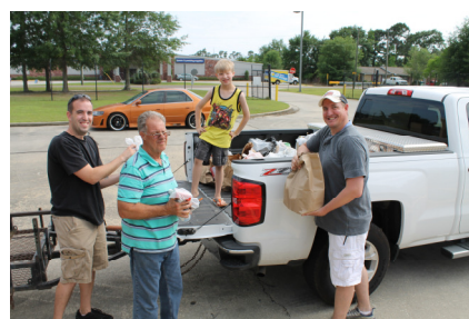
Members of the K of C Council 9094 and St. Vincent de Paul transfer donated food stuff to the storage area of St. Vincent de Paul.