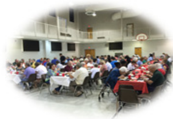
Members of the Meridian Catholic Community enjoying a wonderful evening filled with fellowship and pasta!