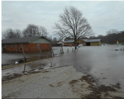
Flood waters still prevent recovery work in the Lyons community area. IN other areas near the community college, water is down and cleanup and restoration is under way.