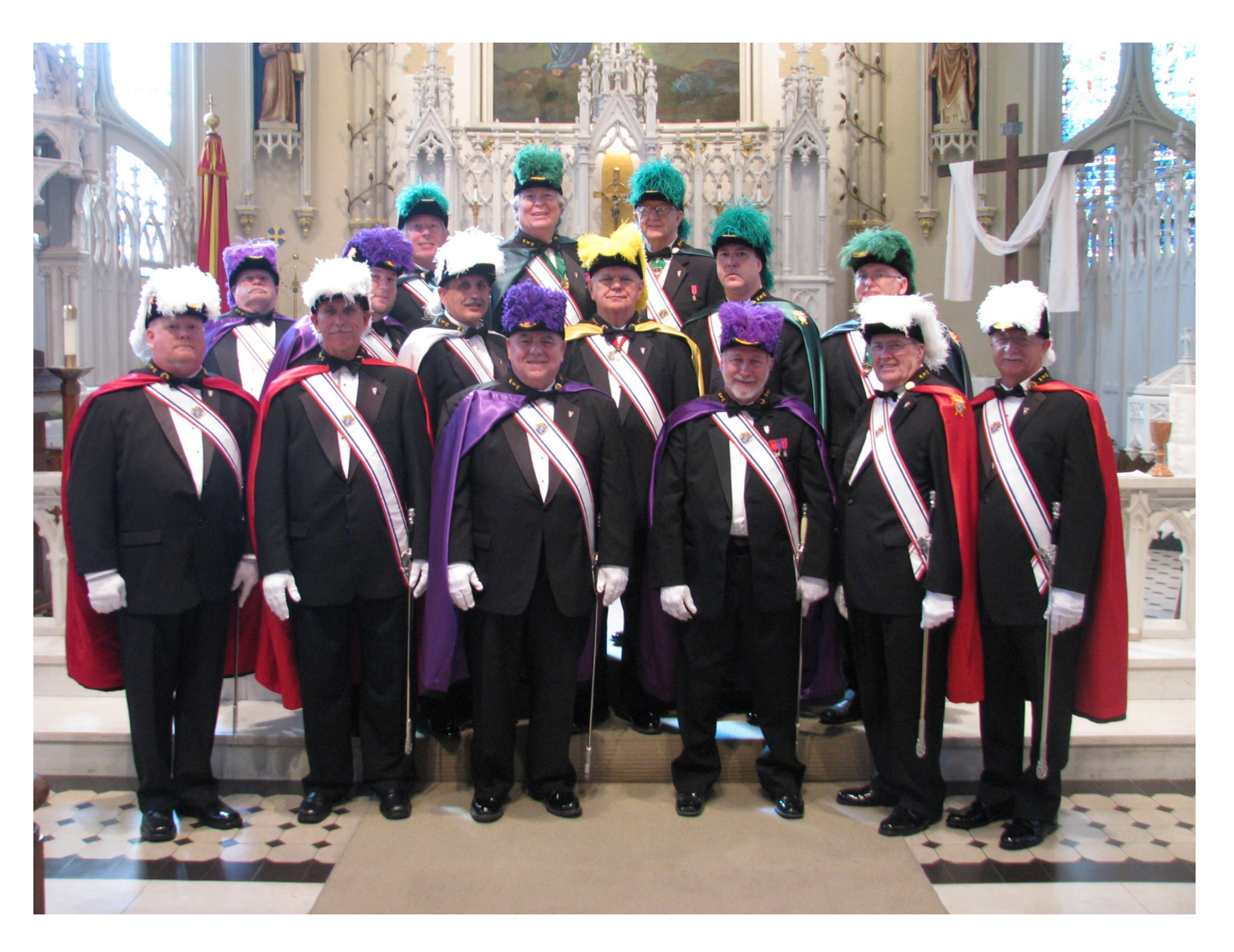
Members of the 4th Degree Knights of Columbus who dressed out for the Convention Dinner and the Convention Masses