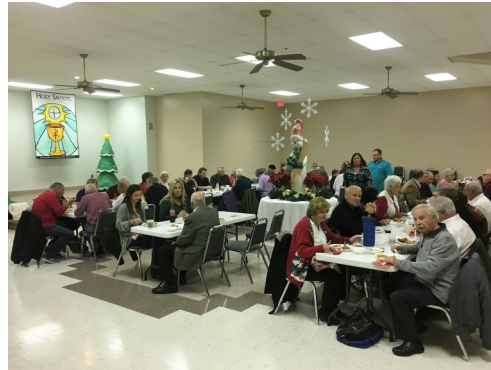
Holy Savior Council 7854 hosts Christmas Social with the Ladies Auxiliary on Dec 7.