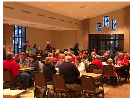
Parishioners enjoying one of Friday night Lenten meal.