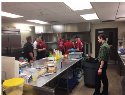
Members of St. Richard Council 15131 preparing a Friday Lenten meal after the Stations of the Cross.