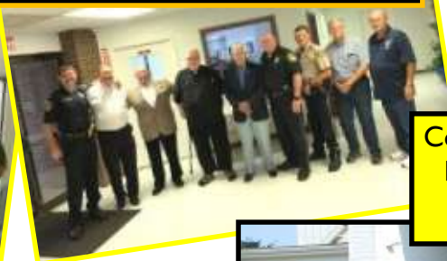
Council 4472 provide Holy Spirit Parish with coffee and donuts after mass