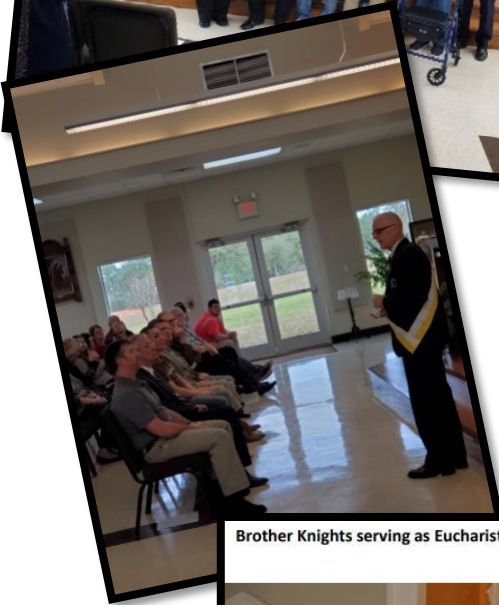
Brother Knights serving as Eucharistic Ministers & Altar Servers at our January Corporate Communion