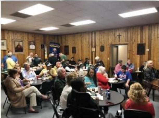
Council 802 Meridian holds a Super Bowl Party