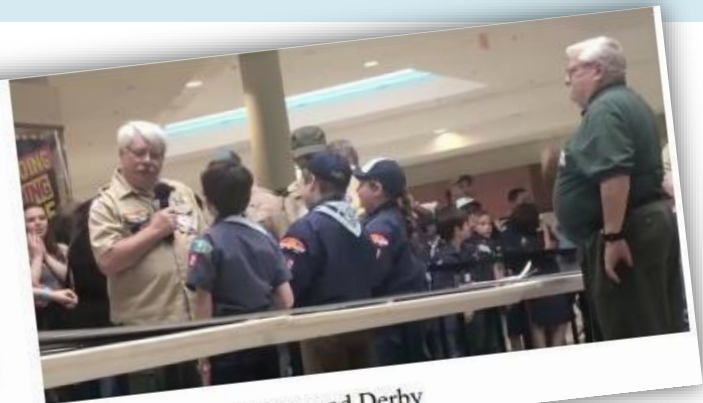
Council 802 Knights in Action at the 2020 BSA Pinewood Derby