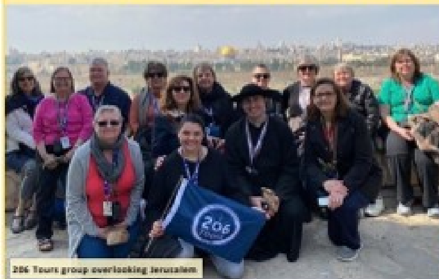
206 Tours group overlooking Jerusalem