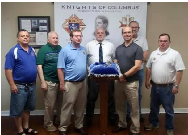
Columbus 7974 transfers Silver Rose to Tupelo 8848