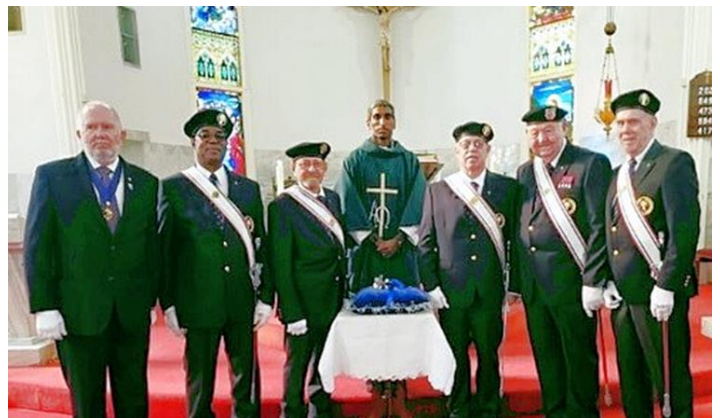
Silver Rose Mass hosted by Council 802 at St. Patrick Meridian 26 September 2021