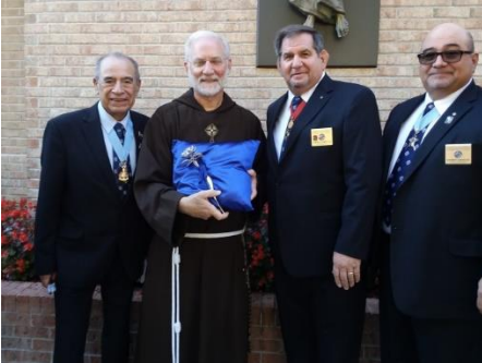
Transfer to Mississippi Jurisdiction from Alabama at EWTN