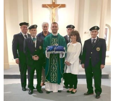
Pascagoula - Gautier Silver Rose Mass