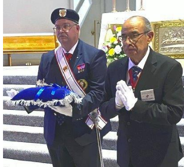
Transfer to Louisiana at St. Charles Borromeo, Picayune