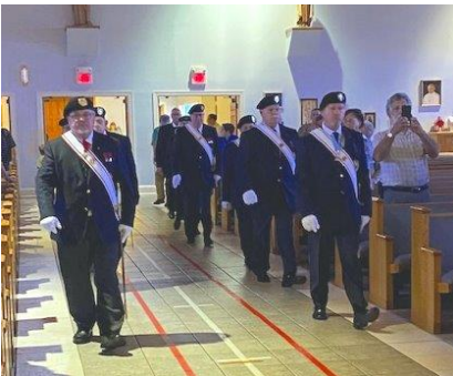
Honor Guard at St. Charles Borromeo