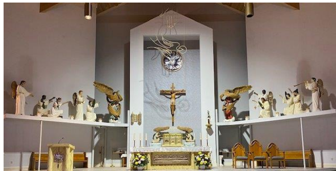
Altar at St. Charles Borromeo