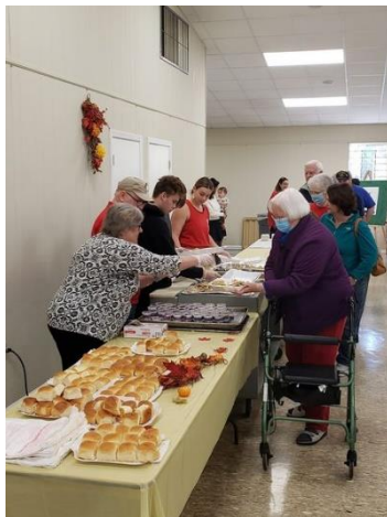
Assembly 558 in Vicksburg help their annual Turkey dinner for Thanksgiving.