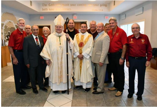
State Deputy and Council 6872 members presented a check for $11,700 to Bishop Kihneman to help with Hurricane Ida repairs to St. Charles Borromeo church