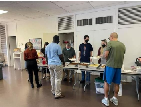
Knights with Council 14051 cooked and served dinner to students at the Catholic Student Center at U of M.