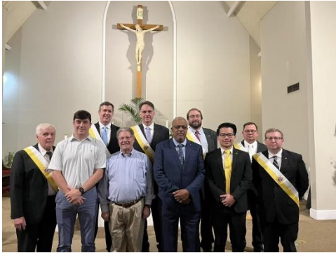
On October 24, they hosted their first new Exemplification Ceremony.

Tupelo Council 8848/Assembly 2131 have been busy. Check out some of their activities.