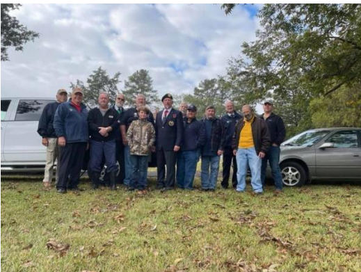
Members from Bishop R. O Gerow Assembly 554, Holy Savior Council 7854, Fr. Emil J Kapaun Assembly 3826 and Bishop Brunini Assembly 2269 assisted in the presentation of Colors ceremony and the placement of American flags on Veteran grave sites in both the Clinton Cemetery and Cedar Grove Cemetery in observance of Veterans Day.

This project is an annual program activity for the Bishop R.O. Gerow Assembly and Holy Savior Council.