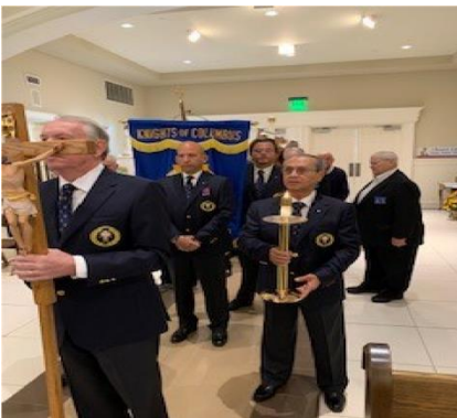
SK with Assembly 3281 in Pass Christian serving at their Mass for deceased members.