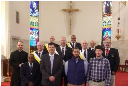
Council 802 held an Exemplification of Charity, Unity and Fraternity at St. Patrick Church in Meridian. They welcomed four new members into the Knights.