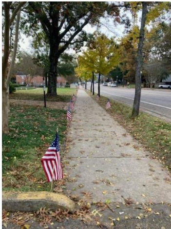
Starkville Council 6765 put out flags for Veteran's Day.