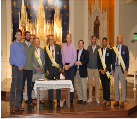
Council 4472 in Pass Christian welcomed some new members.