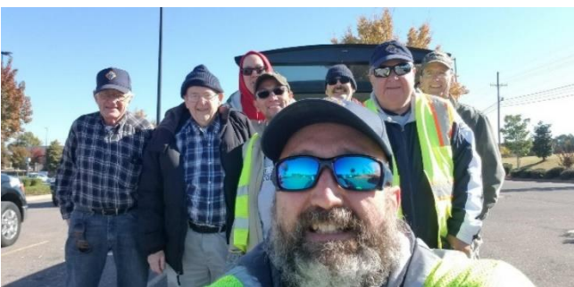
Council 7120 in Southaven participated in Adopt-A-Highway. We cleaned 1 mile of a local highway.