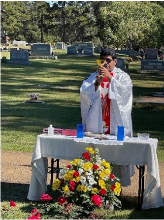
St. Alphonsus Catholic Church in Pike County held an All Soul's Day Memorial Mass in Hollywood Cemetery.