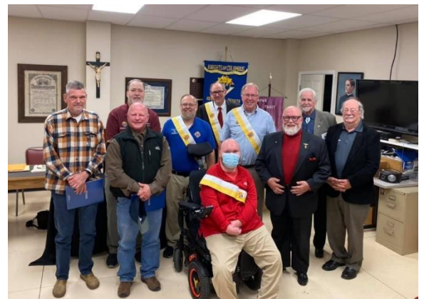
Council 7120 conducted an Exemplification and brought in 3 more members.