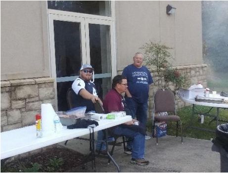
Cooked hamburgers and hot dogs for the St James Fall Festival