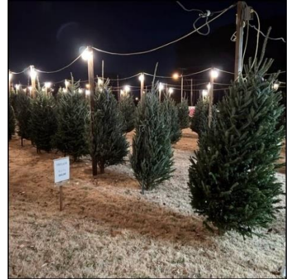
Council 14051 in Olive Branch getting ready for their "Keep Christ in Christmas" Christmas tree lot.