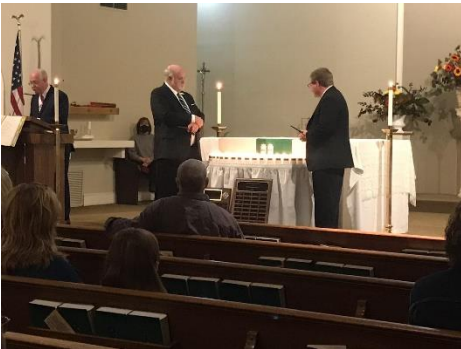
Council 8848/Assembly 2131 held a Memorial Mass for Deceased Brothers.