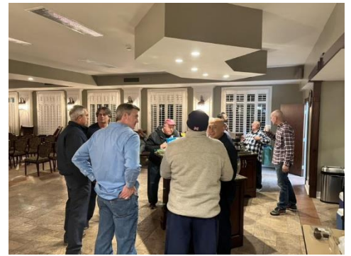
Council 8848 sponsored its Annual Men's Retreat for the Men of St James and surrounding Parishes at St Bernard Abbey in Cullman, Alabama. This was the 29th year of the Retreat.