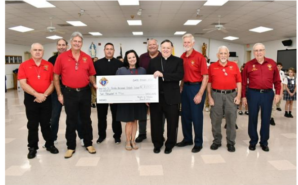
Council 6872 also made a $2,000 donation to their Elementary School