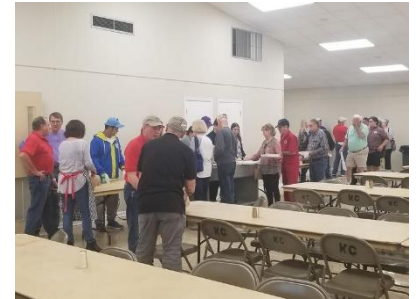
Vicksburg Council 898