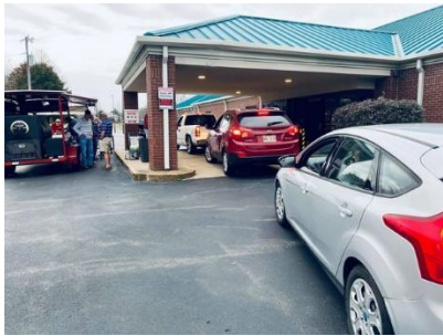
Olive Branch Council 14051