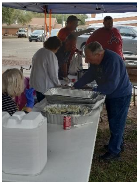
North Biloxi Council 9094