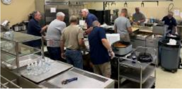
Gulfport Council 7910

Several Councils hosted fish fries this Lenten season.