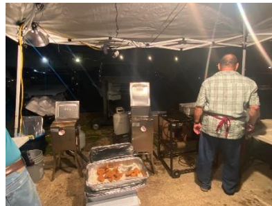
Bilox1 Council 1244