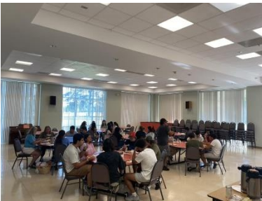
Knights cooking breakfast for Confirmation retreat