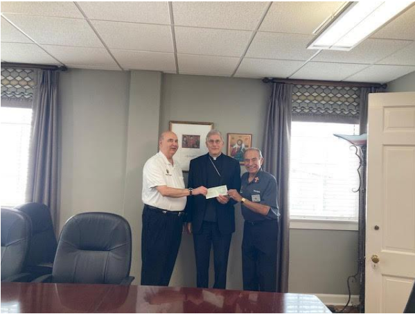
Presentation of Christopher Fund check for $1,611.19 to Diocese of Jackson