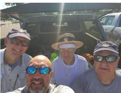
Council 7120 participating in the Adopt-A-Highway program, in which they clean up part of a local highway to help the community.