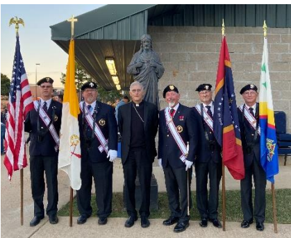
4th Degree Color Guard members from Bishop R.O. Gerow Assembly 554 and John Edward Tracy Assembly 3863 in Jackson, MS participated in halftime festivities for St. Joe's homecoming game Friday night in Madison, MS. The St. Joe Bruins won 35-20.