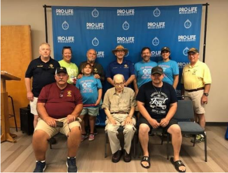
Walk for Life hosted by Knights this October.