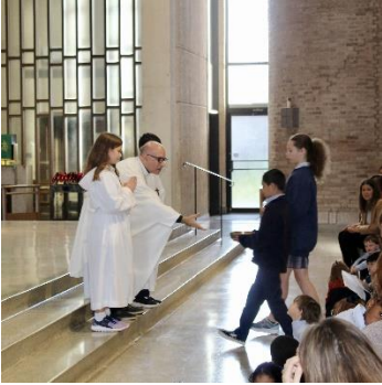
White Mass for Healthcare Workers at Saint Richard Catholic Church was led by their 6th Grade Cardinals.