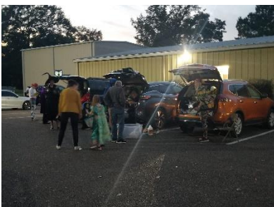
Trunk or Treat