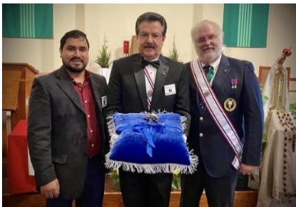
Olive Branch Council 14051